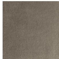
Renos 8 Warm Brown