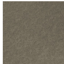
Palma 3 Ash Brown