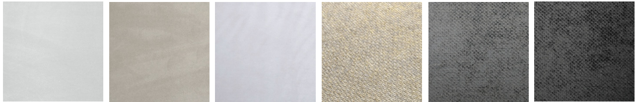
Sinfonia 2 Light Grey