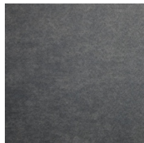
Palma 4 Charcoal