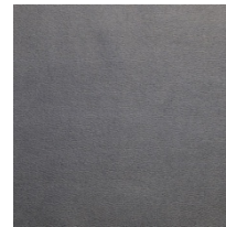
Renos 14 Cold Brown